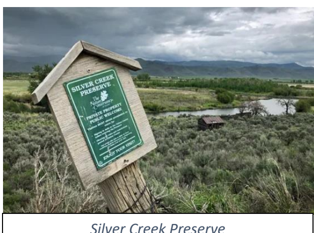
Silver Creek Preserve