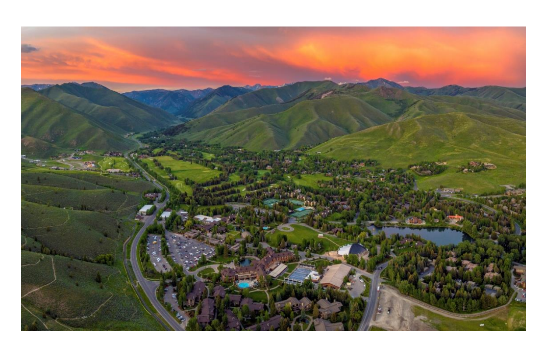
Sun Valley Resort

54<sup>th</sup> Annual Meeting Sun Valley, Idaho June 5 to 7, 2024